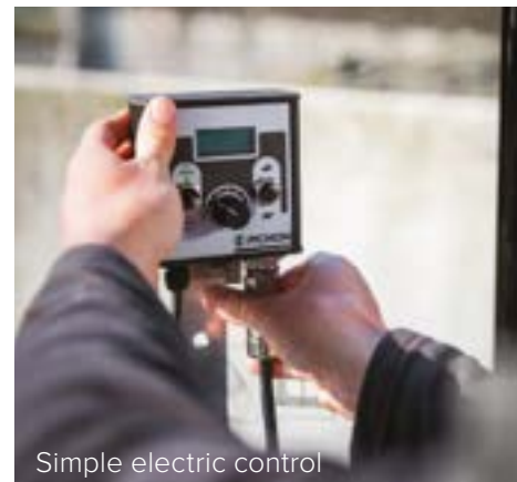
Simple electric control