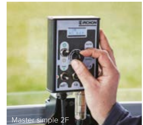
Master simple 2F