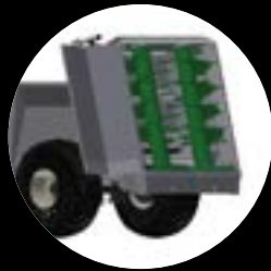
FULL WORKING WIDTH