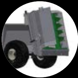
REDUCED WORKING WIDTH