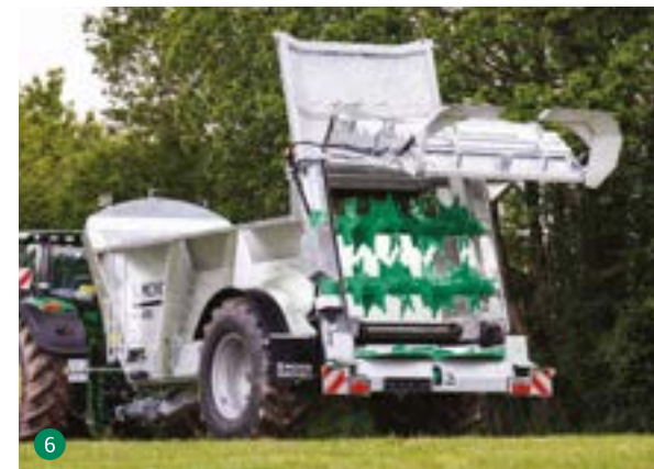
3 | Right and/or left side deflector(s)